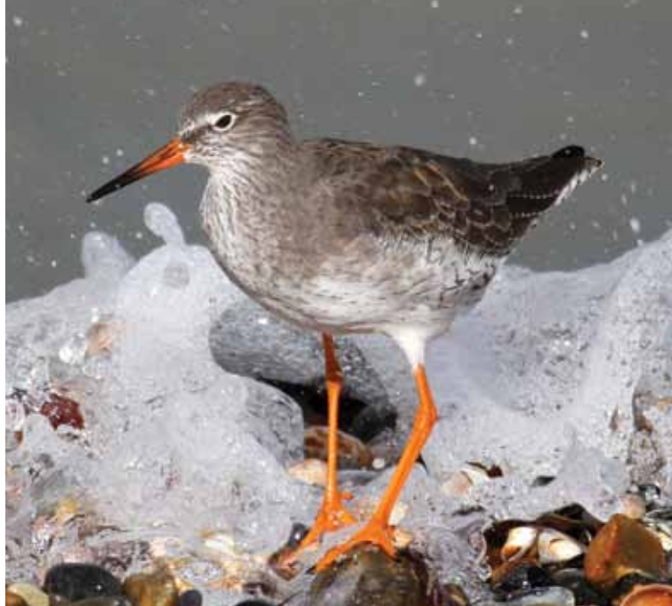
Redshank at Springvale

Day Friday Date 25 July Time 1pm to 3pm Meet Community car park in Arreton village, next to the White Lion public house GR 534 867 Cost Donation to Wildlife Trust welcome Leader Wildlife Trust 01983 760018