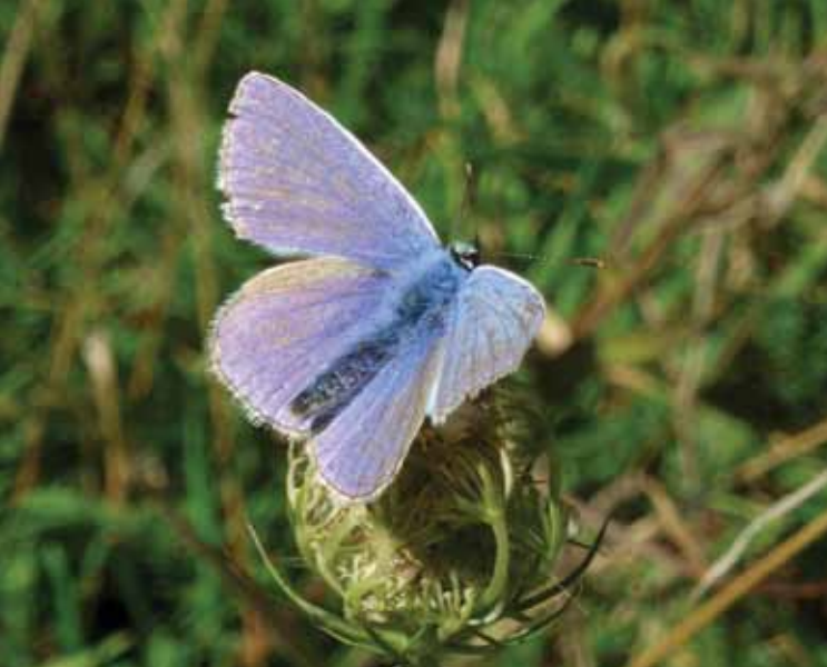
Common blue butterfly at Arreton Down