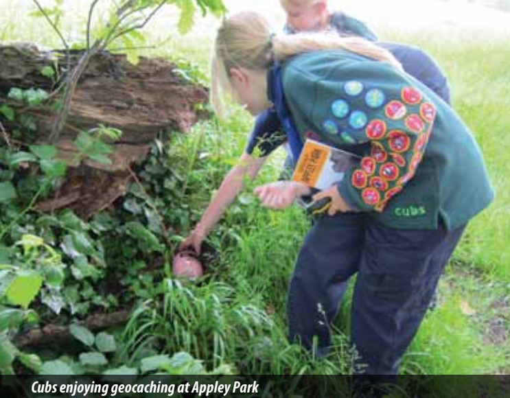
Cubs enjoying geocaching at Appley Park