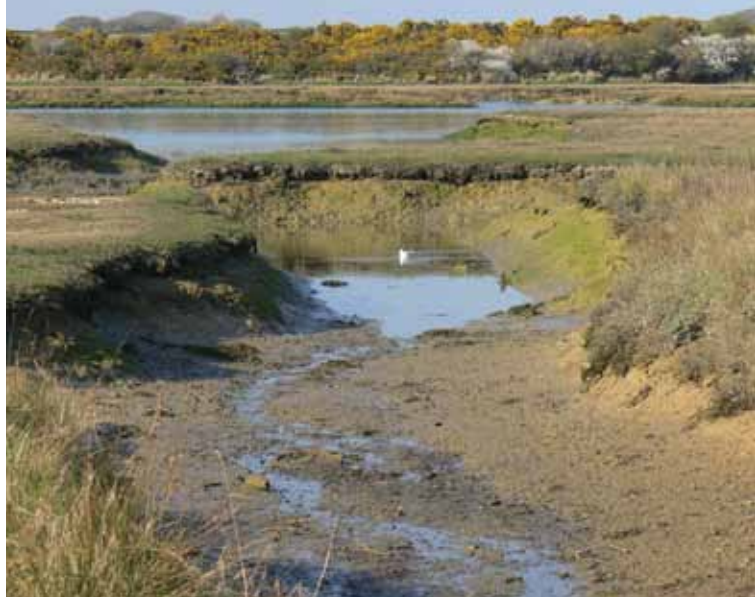
Newtown saltmarsh at low tide

Day Friday Date 19 September Time 7pm Meet Bouldnor Forest Centre (PO41 0AB) - follow track from Yarmouth Road to forest parking site GR 378 896 Cost Donation to Wildlife Trust welcome Leader Wildlife Trust 01983 760018