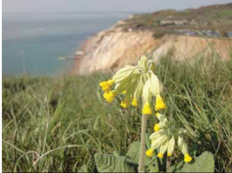
Cowslips at West High Down, overlooking Alum Bay