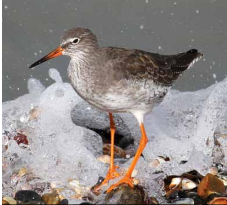
Redshank at Springvale

Day Friday Date 25 July Time 1pm to 3pm Meet Community car park in Arreton village, next to the White Lion public house GR 534 867 Cost Donation to Wildlife Trust welcome Leader Wildlife Trust 01983 760018