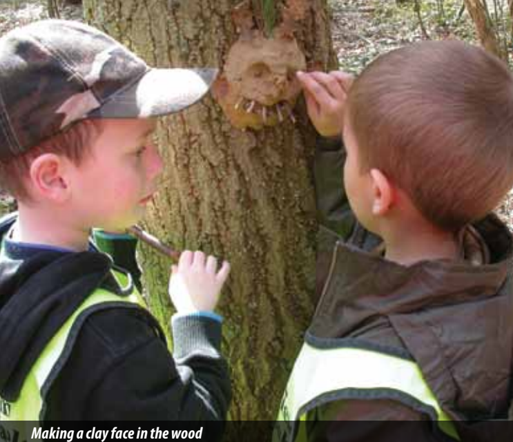
Making a clay face in the wood