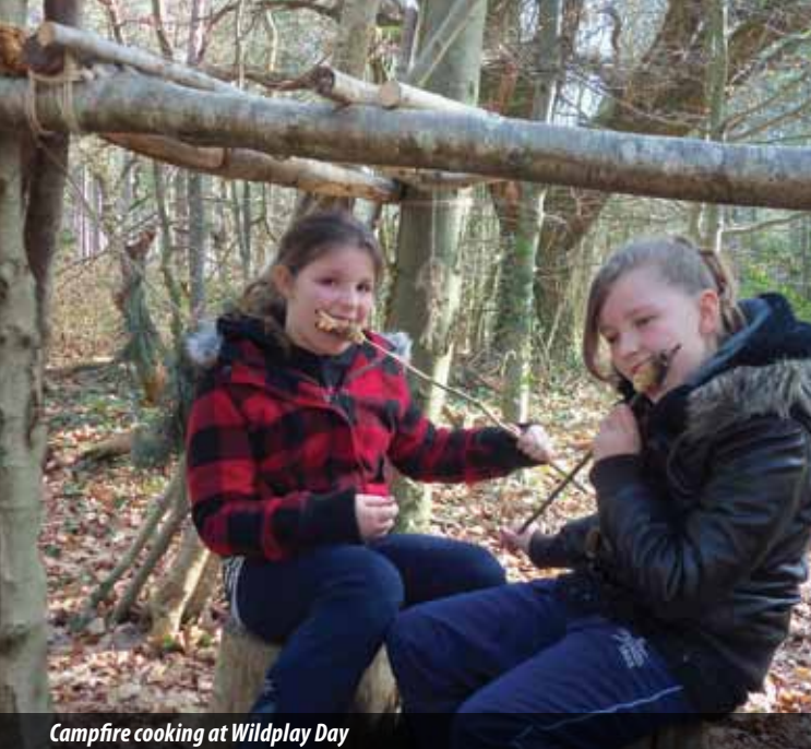
Campfire cooking at Wildplay Day