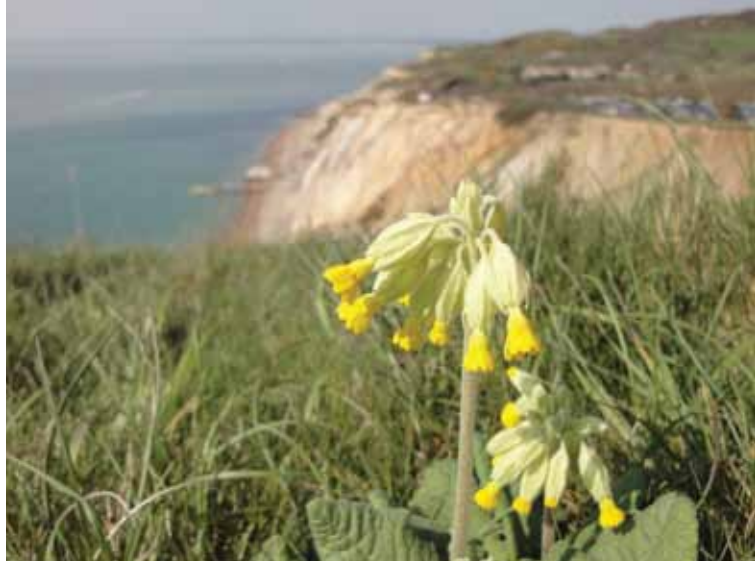
Cowslips at West High Down, overlooking Alum Bay