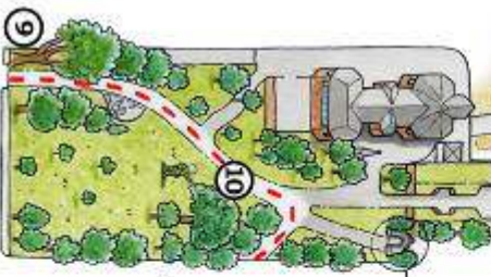
CHURCH LITTEN PARK (DETAIL)